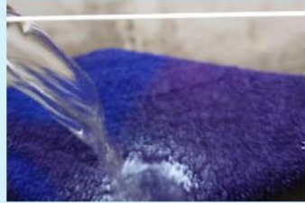
5. Cooling down the temperature for the second time