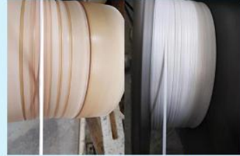
6. Dry the nose strip and rolling and packing