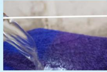
3. Cooling down the temperature