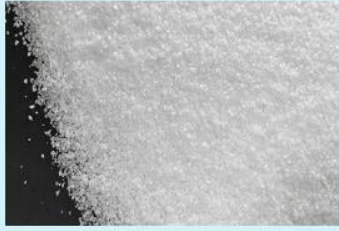
1. Configure and mix the raw materials