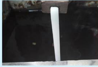
2. Extruded the plastic strip